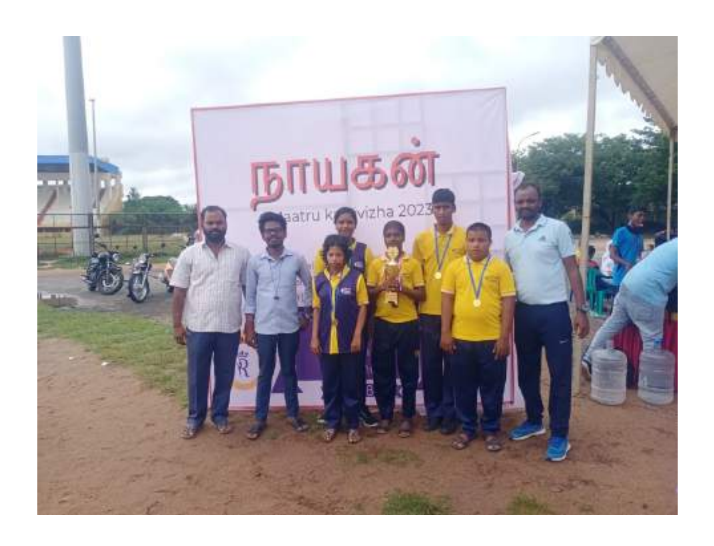
Medal winners at Nayagan Maatru Kalaivizha 2023